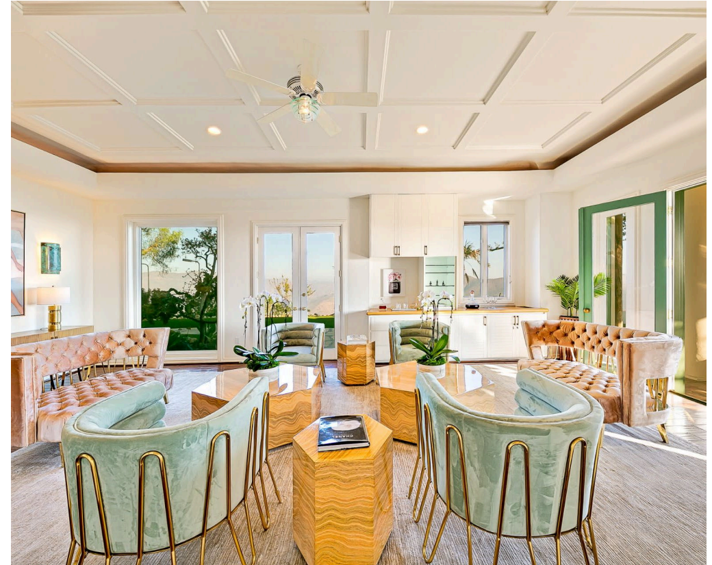
The Malibu Dream Resort sits on 51 acres, ensconced by panoramic views in the heart of the City of Malibu.